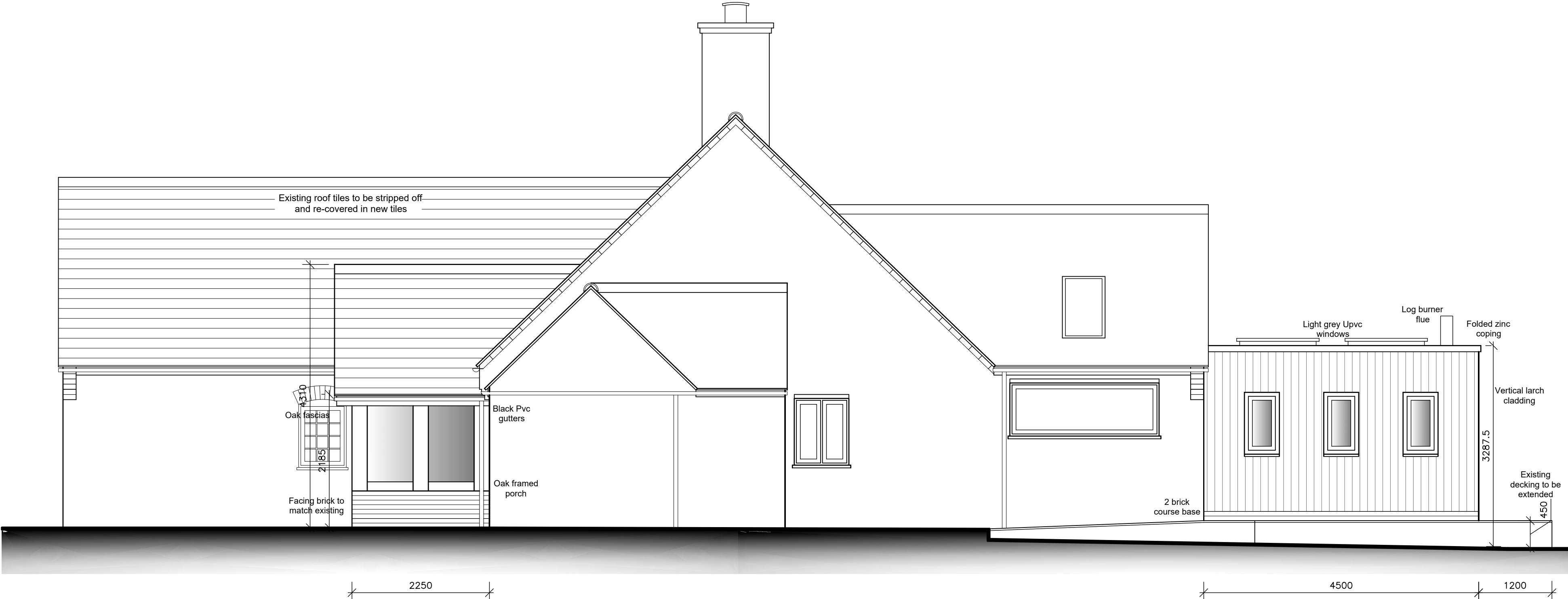
PROPOSED SIDE (WEST) ELEVATION SCALE 1:50